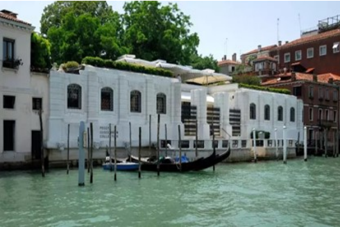
Image: Peggy Guggenheim Collection Museum in Venice by Peter Haas, Creative Commons Attribution-Share Alike 3.0 Unported license.