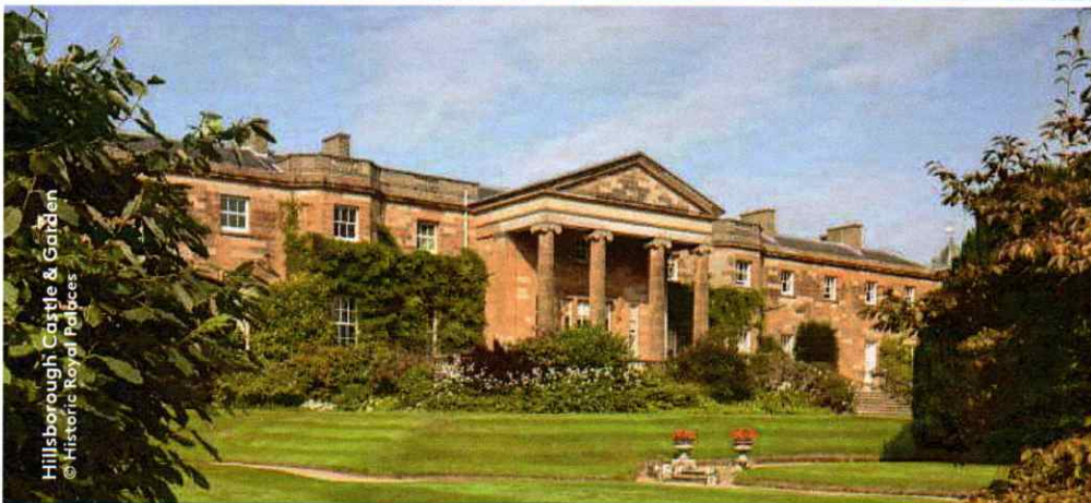
Hillsborough Castle & Gardens

A warm welcome awaits those visiting Belfast. The city has undergone an enormous transformation in recent years to become a vibrant and interesting place to visit with fascinating heritage, delicious food and modern art to enjoy. As well as elegant Victorian buildings, modern developments include the Titanic Quarter. The former dockyards have given way to the impressive developments along the River Lagan. Further afield, the beautiful countryside and history of Northern Ireland is within easy reach including the spectacular Giant's Causeway, Hillsborough Castle and Dunluce Castle.